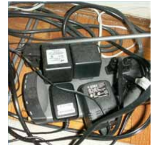
Tripping & Overloaded Circuits