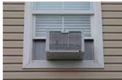
Window A/C Units