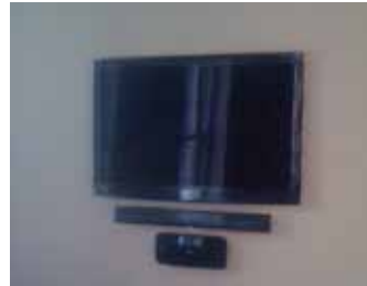
Entertainment System Wiring